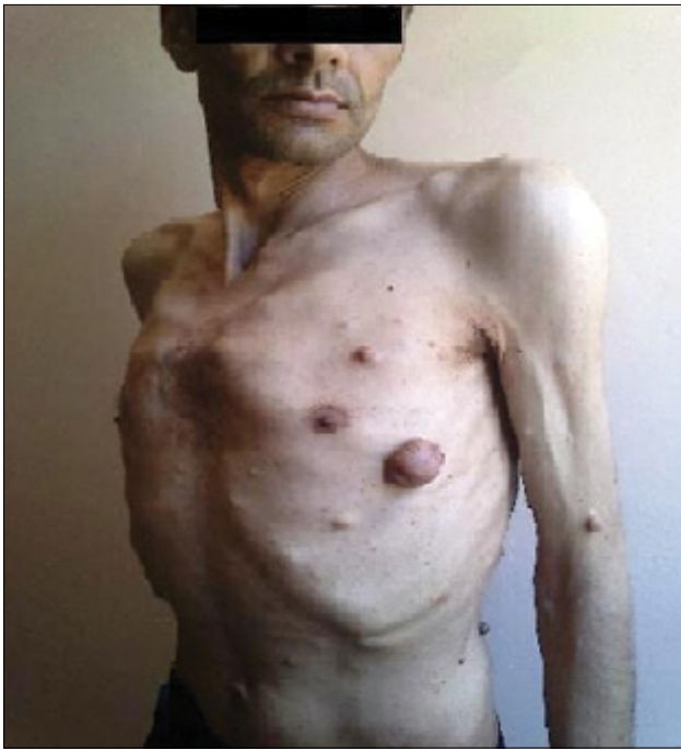
Figure 1. Cutaneous neurofibromas

Bronchoscopy found left vocal cord paralysis, with an aspect of extrinsic compression at the entry of the left main bronchus with two small vegetations and broadening of the left interlobar carina; the left upper lobe was infiltrated with vegetations. There was stenosis of the superior segmental