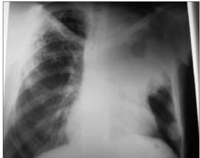
Figure 3. Chest X-ray: opacity of the upper two-thirds of the left hemithorax, associated with left basal opacity and contralateral nodular and micronodular opacities