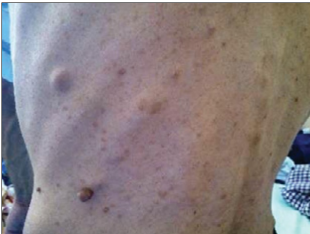
Figure 2. Café au lait spots