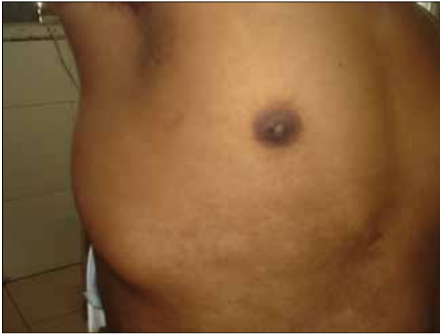
Figure 1. Young male with right chest wall swelling