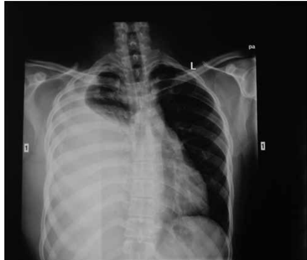
Figure 2. Chest X-ray showing massive right sided pleural effusion