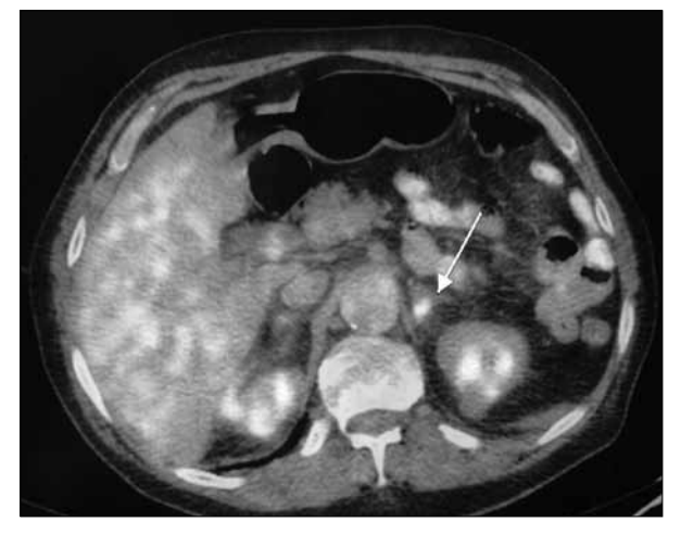
Figure 2. PET-CT showed pathological activity on the medial cruris of the left surrenal gland (SUV max: 4.01)

results in the chest are granulomas, sarcoidosis, histoplasmosis, tuberculosis, chronic inflammation and Aspergillus infection [8]. latrogenic procedures such as placement of chest tubes, percutaneous needle biopsy, mediastinoscopy, talc pleurodesis, radiation pneumonitis and oesophagitis might also cause false positive results. Indeterminate adrenal masses on CT are seen in approximately 5-15% of patients with NSLC, but only around 60% represent metastases. PT-CT is effective in discriminating between malignant and benign adrenal masses [4]. A recent large scale study in patients with NSCLC after potentially curative surgery, the diagnostic performance of PET-CT was evaluated, with results as follows: sensitivity 97%, specificity 96% and negative predictive value 99%, but positive predictive value relatively low (81%) compared to preceding studies [3]. In this case also, false positivity of the surrenal lesion was misinterpreted as recurrence of lung cancer. Several studies used SUV cut-off 2.5 to differentiate malignant from benign lesions [9,10]. Although this patient's lesion had a SUV value >2.5, the pathology of the lesion was benign. Solitary extra-pulmonary lesions were