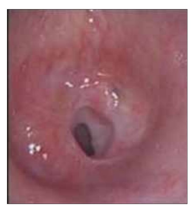
Figure 1. At the FOB, approximately 2 cm after plica vocalis a stenosis which causes narrowing in the lumen at a rate of 80% was observed

The equipment for APC consisted of the APC probe, an argon-gas source and a high-frequency surgical unit (APC 300, ERBOTOM ICC; Erbe Germany). To deliver the gas, a flexible monopolar teflon tube with a 1.5 mm diameter and 150 cm length was used; this was put into the working channel of the flexible bronchoscope. Energy at 30-40 W and argon flow at 0.5 L/min were then applied to the teflon tube. The stenotic lesion was endoscopically visualized and then coagulated at the site of the stenosis. The time it took to perform each coagulation was about 1-2 s, and coagulation was repeatedly performed at the stenotic site. Thereafter, the devitalized tissue was mechanically removed with grasping forceps.