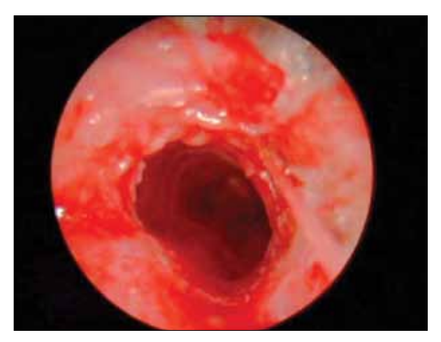
Figure 4. The dilatation occurred in the lumen was seen in the control bronchoscopy performed 1 week later

and still not standardized or unified around the world. However, this clinical entity often requires interventional bronchoscopy before surgery is considered [21].