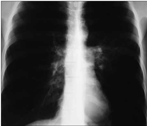
Figure 1. Postero-anterior chest x-ray showing both lungs to be markedly hyperlucent associated with low position of the diaphragm and decrease of the heart width. Notice the poorly defined infiltrate in the left hilus consistent with contusion

It is widely known that any patient who experienced a severe blunt chest injury should be evaluated for a serious