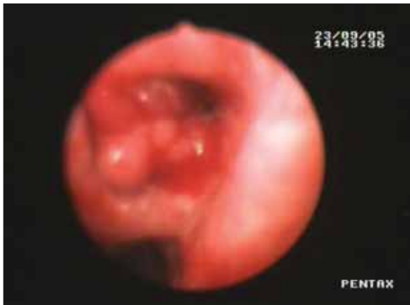
Figure 1. Bronchoscopic view of the bronchus of the right upper lobe showing a polypoid tumor, which was very soft fragile and also free of coating and ulceration

(Figure 2). Post-operative course was uneventfully. At the 2 nd year follow-up, the patient was fully recovered and no recurrence was detected.