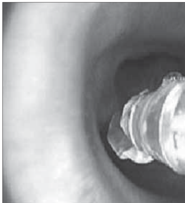
Figure 2. Probe placed in the working channel of the bronchoscope

Between October 2006 and June 2007, EBUS-guided transbronchial needle aspiration (TBNA) evaluation of mediastinal lesions were carried out in 45 patients without any known diagnosis but with enlarged mediastinal lymph nodes on their CT scan. Patient selection was