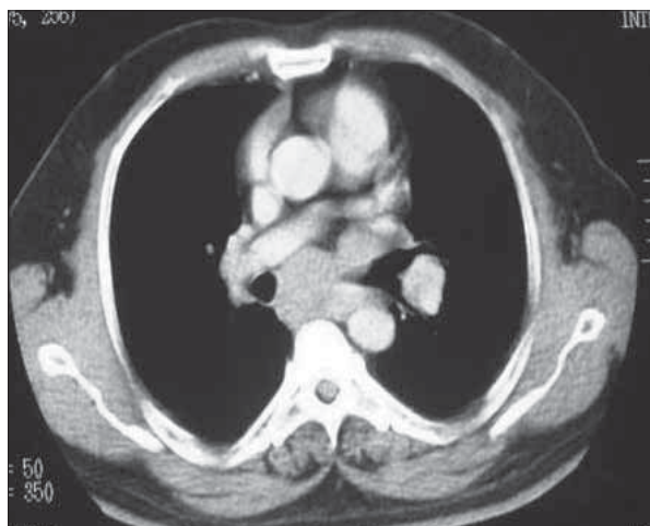
Figure 3. Location of the lymph node on Thorax CT