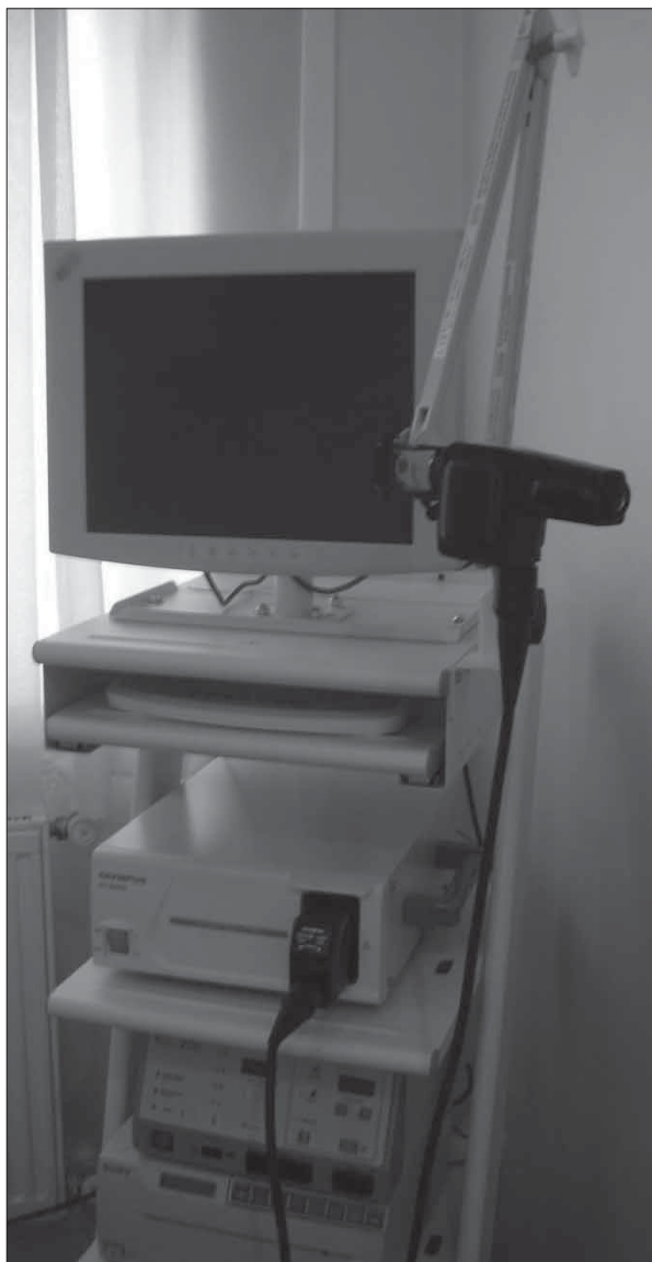
Figure 1. Ultrasonic probe with driving unit and processor

aid of CT fluoroscopy [6] as well as endobronchial ultrasound (EBUS) [7,8] has been shown to be feasible and simple to perform. Those studies suggested a significant increase in yield. In previously published studies, it was shown that endobronchial ultrasound (EBUS) with TBNA was highly accurate and cost effective as a diagnostic tool [9].