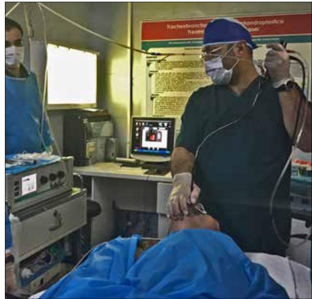
Figure 1. Non-intubated sedated patient under HFJV during bronchoscopy with a flexible fiberoptic bronchoscope via the working channel

HFJV (Monsoon, Acutronic Medical Systems AG, Baar, Switzerland) was applied for 3 min via the working channel of the bronchoscope. HFJV was performed with the following parameters: inspiration time of 45%, driving pressure of 3 bar, peak pressure of 80 mbar, FiO 2 of 30%-100%, and frequency (ventilator rate) of 250/min. After applying HFJV for 3 min to obtain an incremented SpO 2 to 90%, second arterial blood sampling was performed, and the bronchoscopy procedure was commenced (Figure 1,2). The arterial blood