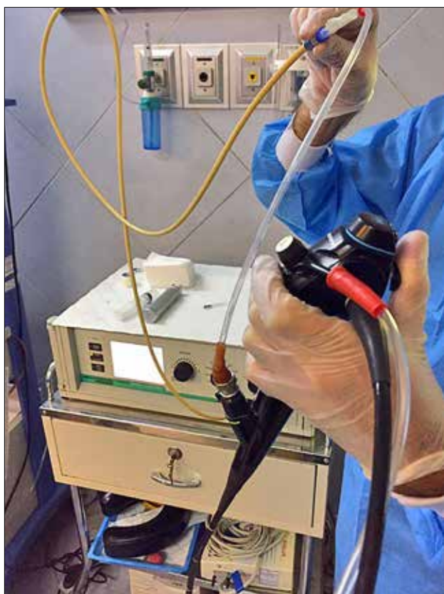
Figure 4. HFJV connected to the working channel of a flexible fiberoptic bronchoscope

pH was compared in two blood samples. The estimated ventilation efficacy and the availability of oxygen was obtained by comparing the partial pressure of carbon dioxide (PaCO 2 ) (mmHg) and the arterial partial pressure of oxygen (PaO 2 ) (mmHg) in two samples. The design of the current study is shown on Figure 3.