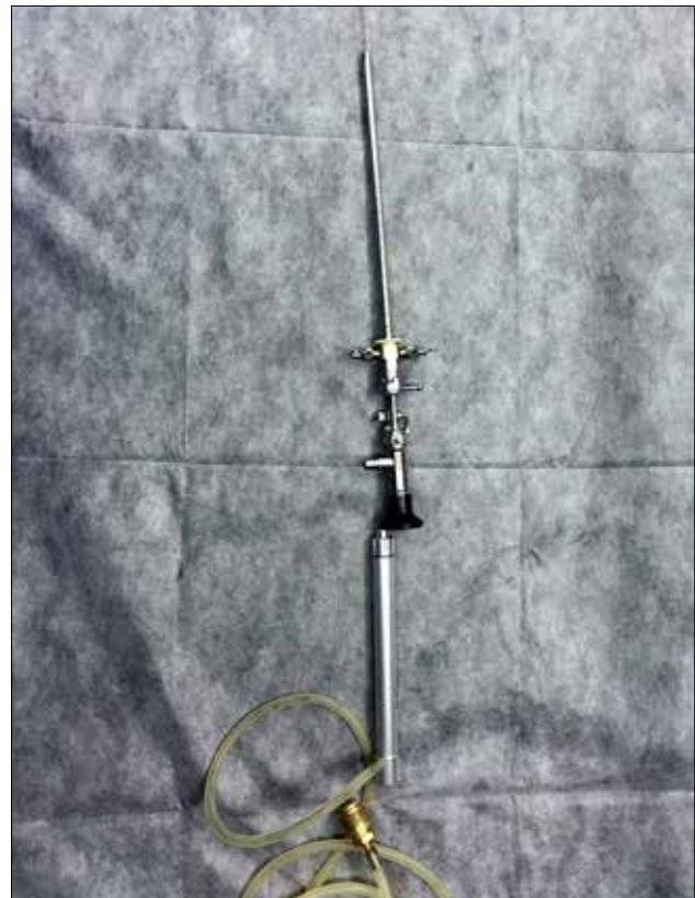
Figure 2. Jet ventilator catheter