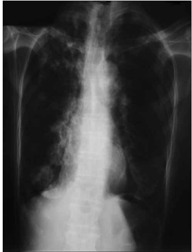
Figure 3. Patient's chest X-ray after 6 th month treatment

The lungs are easily affected by inhalation of aerosolized mycobacteria and is by far the most frequent site of human mycobacteriosis. In HIV(+) patients, the disease is indistinguishable from tuberculosis and is characterized by a very slow progression [6]. Cavitory NTM pulmonary disease is radiographically and clinically indistinguishable from pulmonary tuberculosis. Manifestations range from absence of