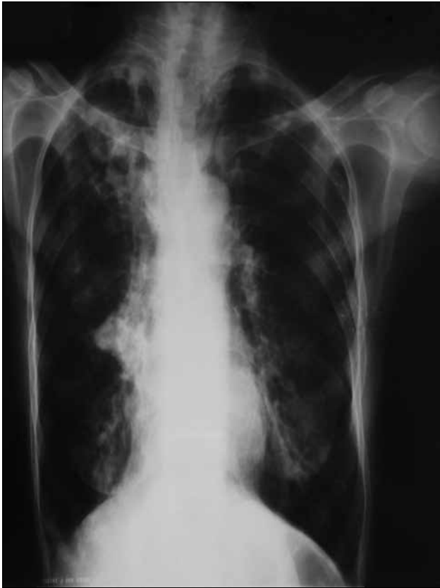
Figure 1. Patient's chest X-ray before treatment